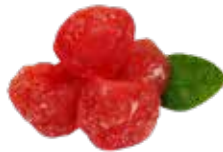
SWEET & SOUR CHERRIES